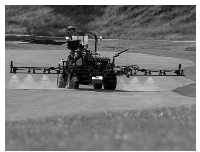
GeoLink's individual nozzle control saves time and money.

RTK: Real Time Kinematic (RTK) satellite correction is a technique used to enhance the precision of position data derived from satellite-based positioning systems, being usable in conjunction with all positioning platforms.