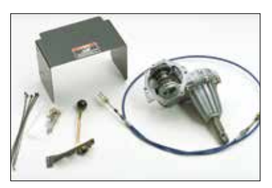
Rear PTO Kit • Rear-mounted, 540 RPM, PTO shaft mechanically driven by transaxle