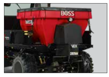
BOSS® V-Box Spreader Engineered to spread sand and rock salt as well as other deicing materials while boasting even more features to help make your job as smooth and steady as possible