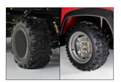
ATV / Snow Tires Aggressive tread to provide extra traction during snowy conditions